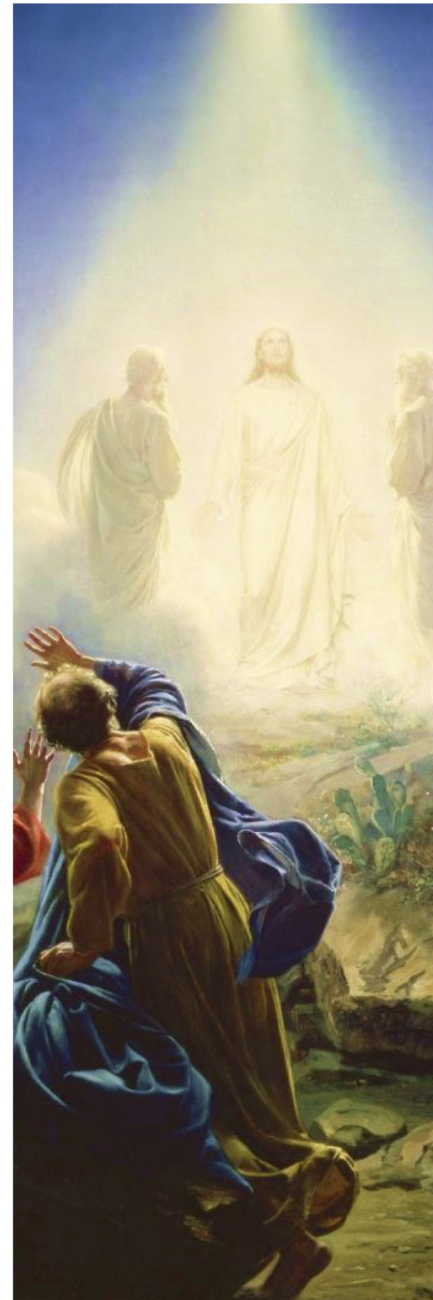
Carl Bloch, public domain, via Wikimedia Commons

Lent is inherently a season of waiting for the fulfillment of a promise. In our own lives, we may be aching for transformation, perhaps for ourselves, or for another. Remember: God enters deeply into our lives, dwelling so intimately with us that he syncs his every breath with ours. Take the next week to think and pray about how the Lord may be asking you to be transformed. Pray today’s Psalm each day, and “Wait for the Lord with courage.”